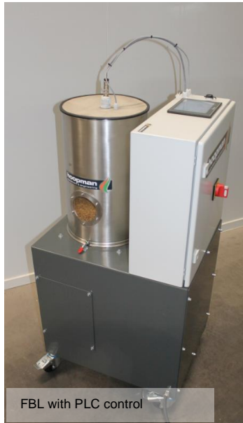
FBL with PLC control

The FBL is a fluid-bed lab dryer specially made for small seed lots (up to 6 litres). The FBL is based on fluid-bed technique shown in our working principle sheet. This small lab machine is easy to move, and easy to use. Standard the FBL will be delivered with an 6l holding cylinder, but you can order a 3-litre drying cylinder for small quantities separately.