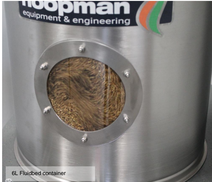
6L Fluidbed container