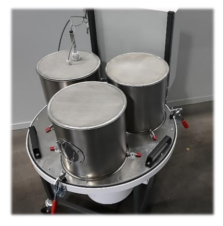
Option: 3-Box adapter