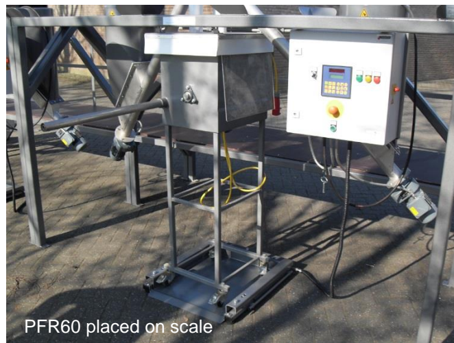
PFR60 placed on scale

There can be placed 2 big-bags on each unit. The big-bags need to be placed in a frame, for a good unloading of this system. Optionally we can provide “powder containers” to have the possibility to switch not empty big-bags. If you are interested in this system, please let us know.