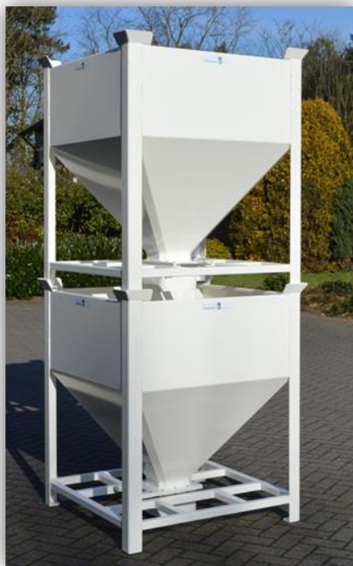
Two SC120 placed on each other

The specially designed Hoopman seed containers are made without any sharp corners. Due to this design the seeds cannot get stuck in the container and a complete emptying is secured.