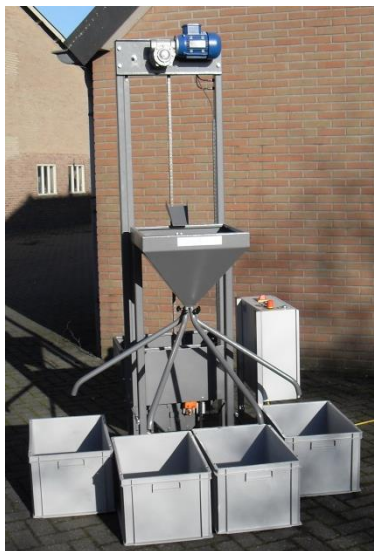
SE-60L with Seed Lot Splitter

Simple seed bucket elevator, easy to use