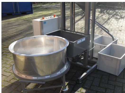
Easy to empty standard dryer container into the seed lift

To make the filling of the CSS-400 Sieve System more simple, we have the Seed Lift available. This simple single bucket elevator can be easily filled with seeds on a low level. It is even easy to empty our standard drying containers in its hopper.