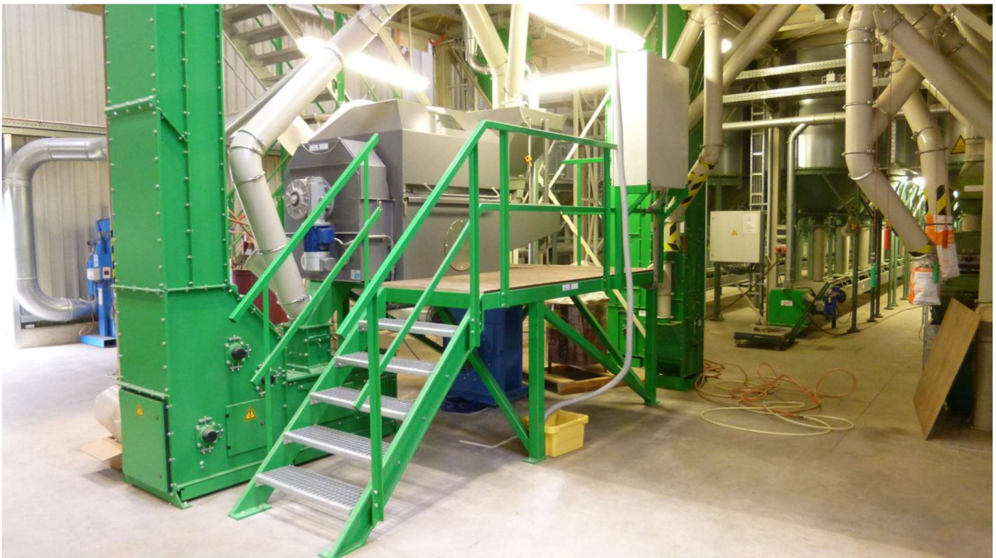
RFBC800 Conditioner with capacity of 4-8t/hr of wheat

Due to the variety of coating processes and humidity conditions of your specific business, we configure the dryers based on our test equipment. Ask us for more information about a dryer for your specific process.