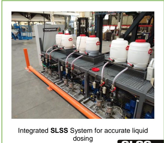
Integrated SLSS System for accurate liquid dosing