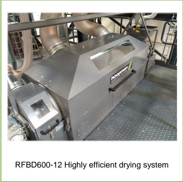
RFBD600-12 Highly efficient drying system