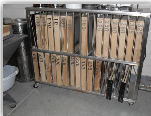
Option: Storage cart for sieves