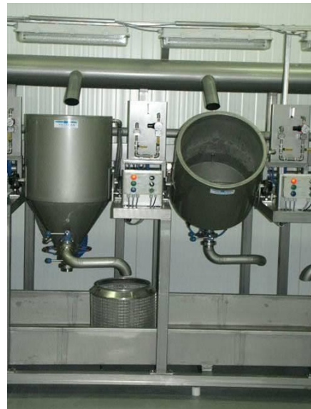
Hygiene... HACCP equivalent engineering