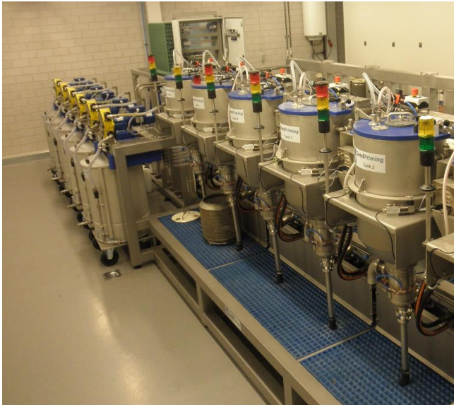
High-Tech, for complex protocols with sophisticated ERP seed lot specific protocol communication