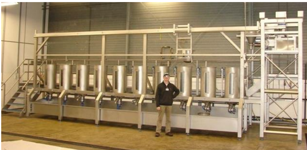
High volume/throughput & mechanic seed supply