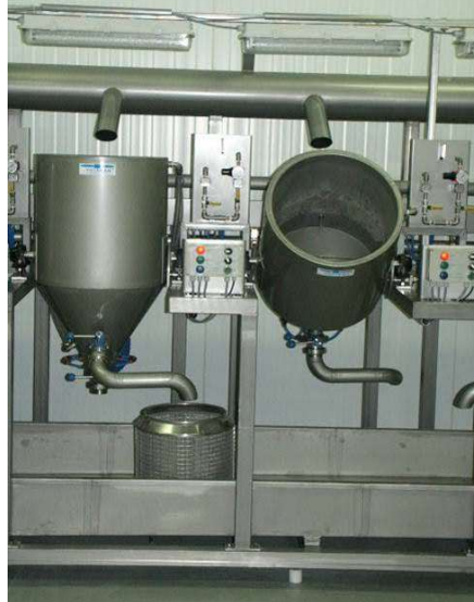
Hygene... HACCP equivalent engineering