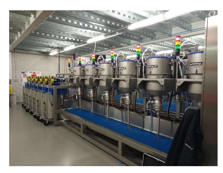
High-Tech, for complex protocols with sophisticated ERP seed lot specific protocol communication